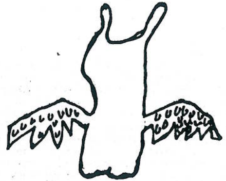
↳ The Anne McCaffrey