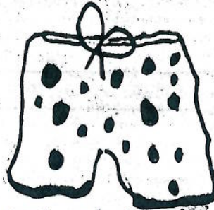
↳ The Stephen Hawking